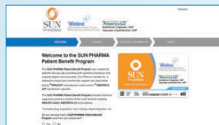
Sun Pharma Benefit program website