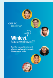
Get to know WINLEVI® treatment brochure