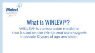
How to use WINLEVI® administration video