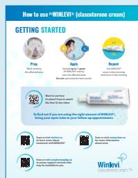
Dosing and administration guide